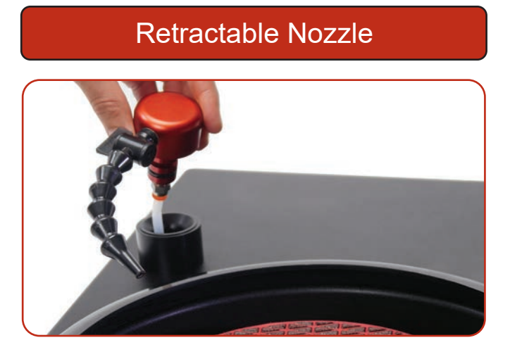
Retractable coolant nozzle allows quick and easy sample/bowl cleaning.